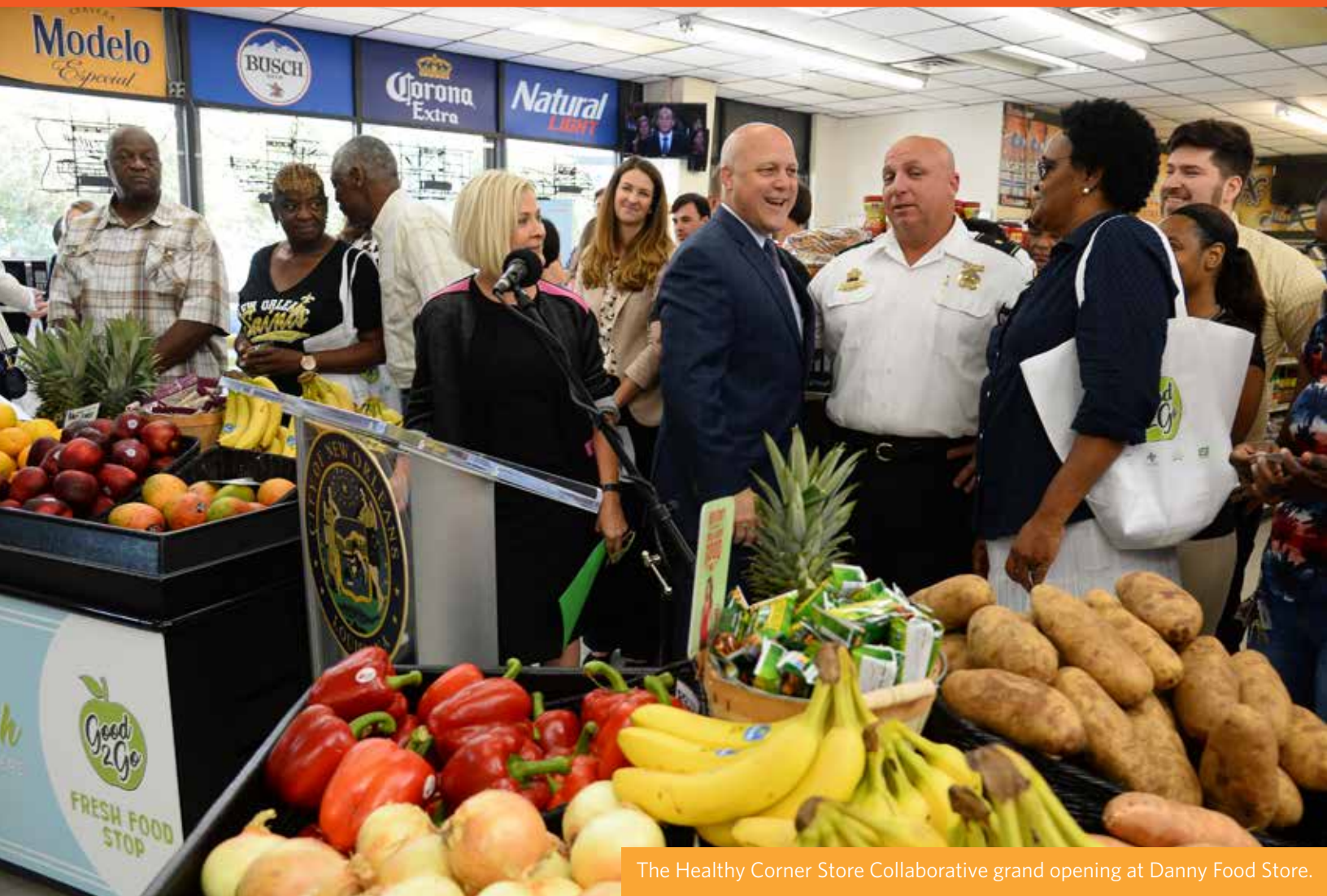
The Healthy Corner Store Collaborative grand opening at Danny Food Store.