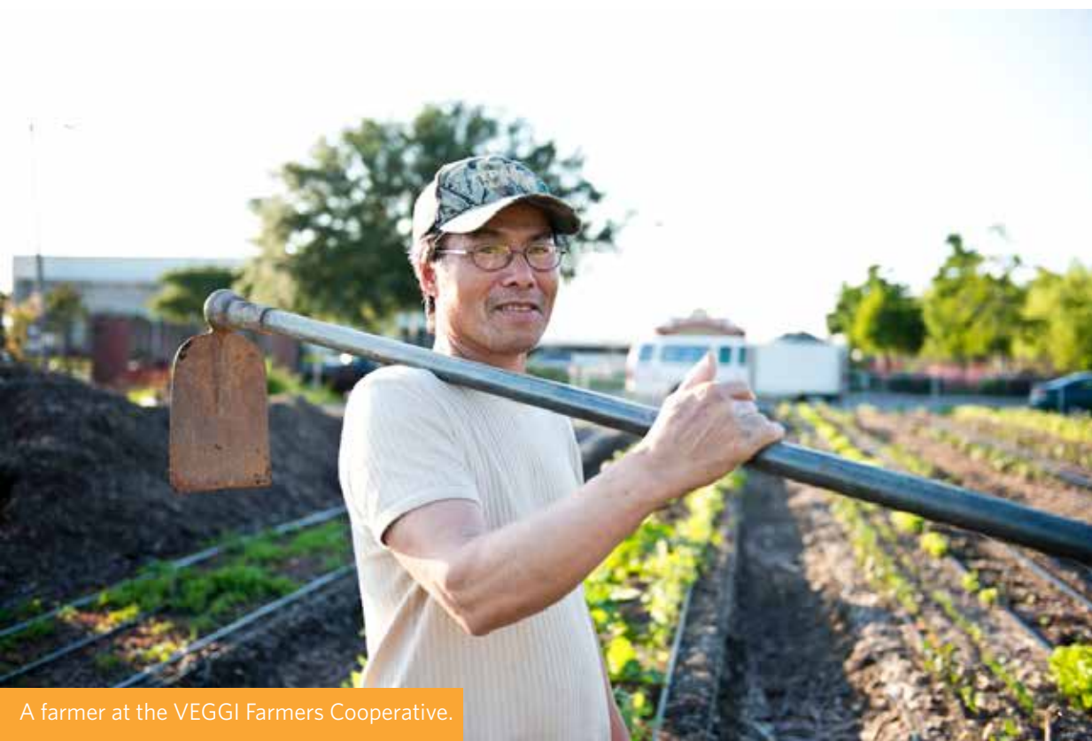
A farmer at the VEGGI Farmers Cooperative.

Healthy School Food Collaborative captured $10.4 million in federal funding to provide healthy school meals for 40% of New Orleans public school students. In 2017, they supported 34 schools to ensure their school food menus and procurement policies provide students with nutritious meals— 1.4 million breakfasts , 2 million lunches , 607,000 snacks , and 233,000 suppers .