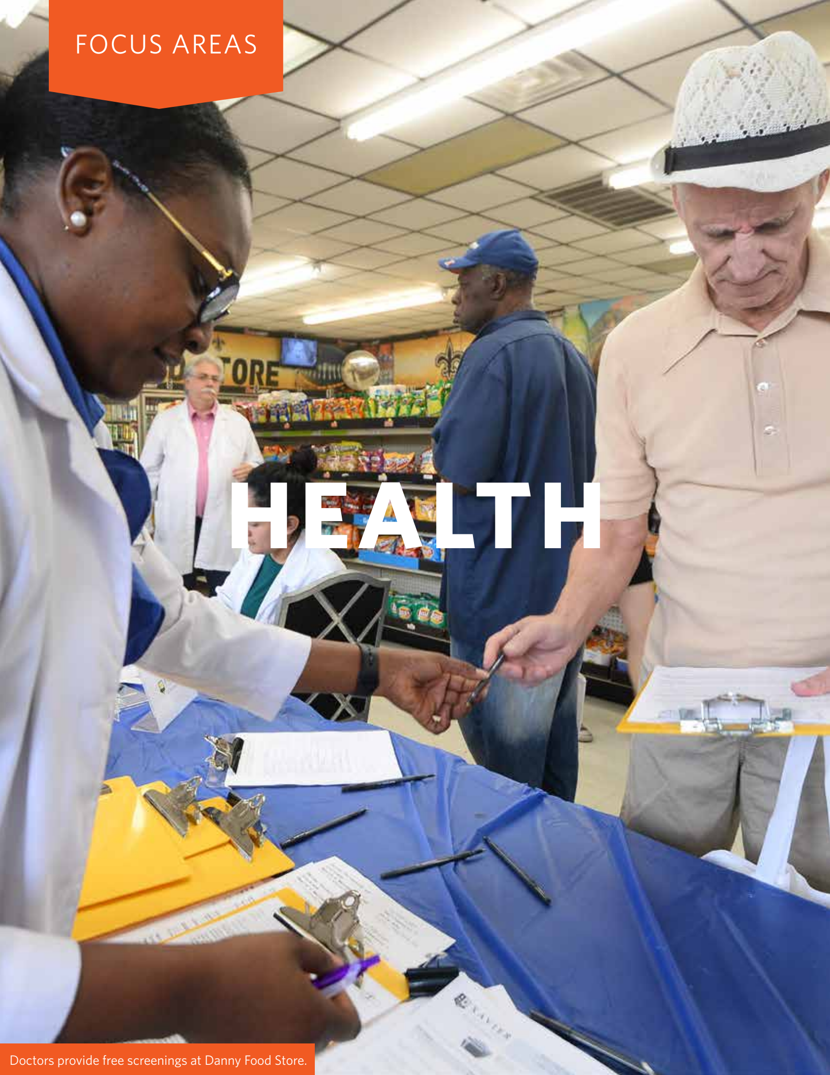
Doctors provide free screenings at Danny Food Store.