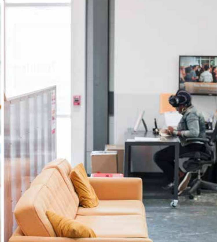
Propeller's 10,000-square-foot work and event space.